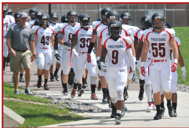
Frostburg enters Saturday having won 10-straight games